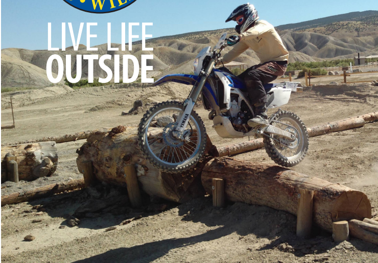
Peach Valley Training Course

Columbine Ranger District; La Plata, Archuleta, Hinsdale Counties